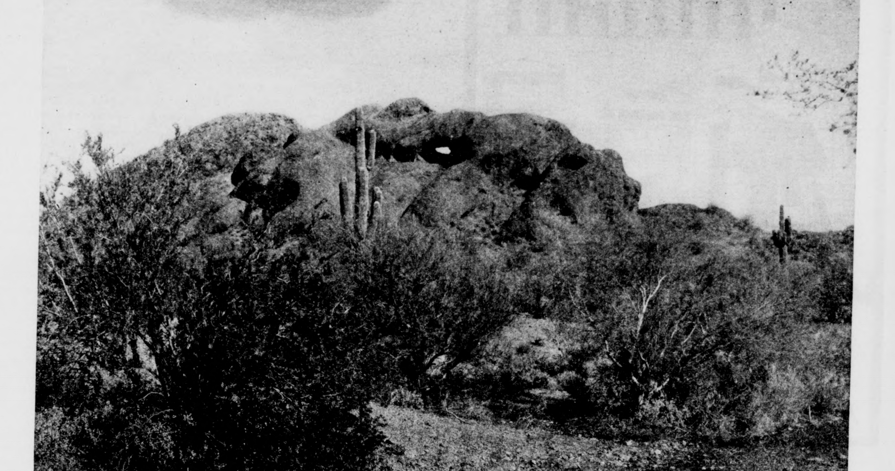
HOLE IN THE ROCK—NEAR TEMPE