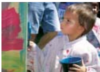
Tempe Arts Festival, Tempe

For further information about the Maricopa Regional Arts and Culture Task Force, see www.flinn.org or www.pipertrust.org or call 602-744-6809