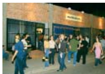
First Fridays, Phoenix

economic activity. Forty percent of that figure ($53.2 billion) came from spending by arts organizations, an amount 45 percent higher than in a comparable study in 1992. The remaining 60 percent ($80.8 billion) resulted from arts audiences' expenditures. Tourists accounted for a sizable proportion of that spending, considering that visitors spend nearly 80 percent more per event ($38.05) than do local attendees ($21.75). In Maricopa County, the nonprofit arts pumped nearly $344 million into the region's economy in 2000.