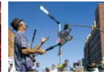
Tempe Arts Festival, Tempe