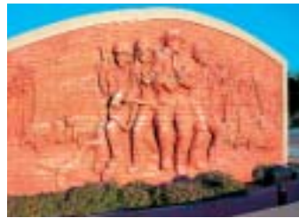
Top: Phoenix Zoo Bottom: Tribute to Firefighters, Glendale

Participating in arts and culture is one of the best ways to bridge differences.