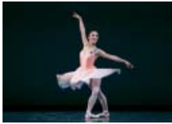
Ballet Arizona, Phoenix

So, can the Valley step up to the promise of arts and culture? The task force's recommendations show that it is possible.