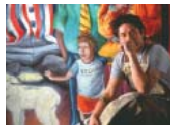
Heard Museum, Phoenix