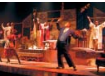
Black Theatre Troupe, Phoenix