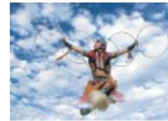
Native American hoop dancer, Phoenix

Arts and culture clearly must be central to the Valley’s economic development. As the following section indicates, other regions have already accepted the business case and are moving ahead. The Valley will need to do the same to remain competitive.