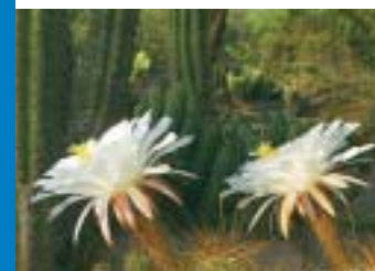
Desert Botanical Garden, Phoenix