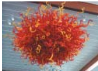
The Sun and the Moon, Glendale Public Library