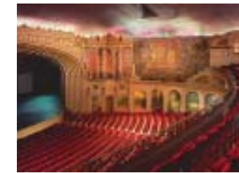
Orpheum Theatre, Phoenix