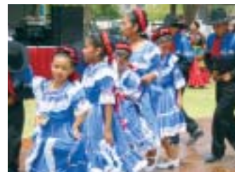
Cinco de Mayo dancers, Mesa

Although he is not the only one to do it, George Mason University professor Richard Florida has made the case most engagingly for catering to and investing in creativity wherever it might be found. As he puts it, the “creative class” is the one most needed for leadership in the global economy. These often young, highly educated people – who first choose where they want to be, knowing that employment will follow – are the ones causing such a stir. Their preferences for where to live, what to do, and how to work are one of the reasons why arts districts, historic preservation, and venues for culture and entertainment at all times of the day and night are in the headlines.