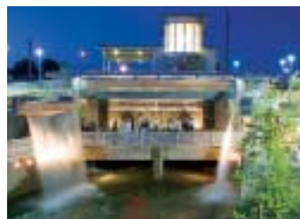
Arizona Falls, Phoenix

The Valley lags on nearly every standard measure of the total arts and culture sector. Data about the arts and culture sector is rarely as detailed as desired, but, there is no mistaking the comparatively negative position as shown in Table 5.