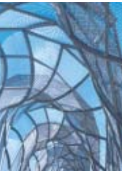
Kyrene Monte Vista Pedestrian Bridge, Phoenix

The Valley has much upon which to build, but the needs are of a sobering size. For example, annual total revenues for arts and culture organizations in the region would have to more than double to reach the median per capita level for the benchmark regions. Arts and culture organizations in the Valley spend more time than their benchmark