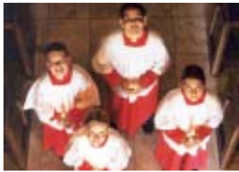
Phoenix Boys Choir, Phoenix