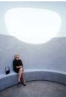
Knight Rise, Scottsdale