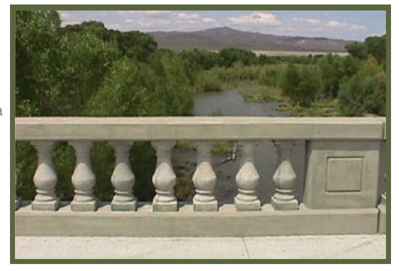
The Winkelman Pedestrian Bridge

TE funds do not cover long-term maintenance. A Joint Project Agreement for maintenance MUST be signed by ADOT and a governmental agency sponsor.