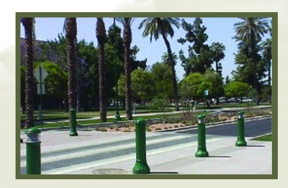
Landscaping along 17th Avenue in Phoenix

Maintenance of landscaping does not qualify under this program.