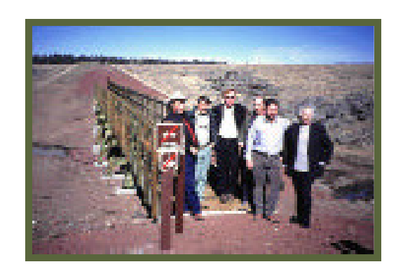
Rails to Trails in Apache County