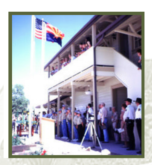
Dedication of rehabilitated Willcox Train Depot

Activity 7 is for projects such as the rehabilitation of historic highway maintenance facilities, train depots, and bridges.