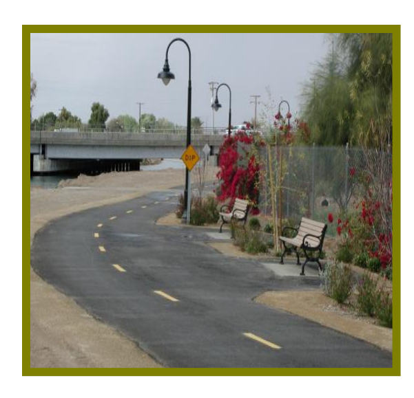
Colorado Trail Pathway