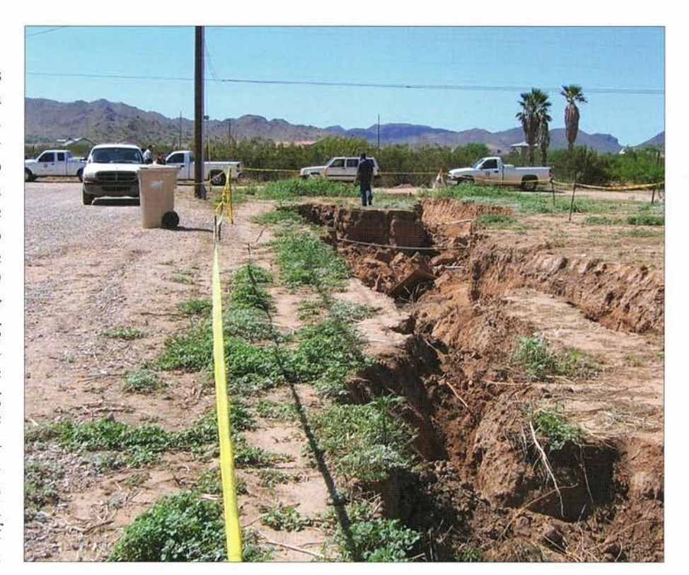
Figure 1: Earth fissure near Chandler Heights, Maricopa County, August 2005. Earth fissures range from insipient, where they are characterized by discontinuous, pock-marked ground and hairline fractures, to mature features miles in length and hundreds of feet deep, with associated gullies at the surface that are more than 10 feet wide and several tens of feet deep.

In August 2005, torrential monsoon rains reactivated an earth fissure near Queen Creek, Maricopa County, Arizona. Overnight, the fissure became an open crevasse 5 to 10 ft wide, and up to 25 ft deep crossing two residential lots (Figure 1). In response to growing public outcry, the Arizona Legislature drafted legislation to map earth fissures in Arizona. Effective 21 September 2006, House Bill 2639 charges the Arizona Geological Survey (AZGS) with 1) comprehensive mapping of earth fissures throughout Arizona, and 2) delivering earth fissure map data to the State Land Department for posting online with other GIS map layers so the public can make customized maps. A complementary statute, A.R.S. 33-422, requires disclosure of earth fissures in non-incorporated areas as part of real estate transactions. To meet the task of mapping all the state's earth fissures, AZGS received continuing funds for hiring three staff geologists and one-time only funds to purchase high-precision Global Positioning System receivers and field-based computers.