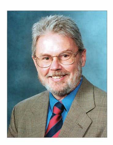
June 6, 2007

The AZGS' earth fissure planning maps are the first statewide compilation of these geologic hazards. Yet this is only the first step in a multi-year program to identify and map in detail all the fissures in Arizona. Making the fissure maps easily accessible will provide buyers and developers of real estate, and local government planners the information they need to make informed decisions. But our job as scientists can't stop with the public release of either the planning maps or the upcoming stream of high-resolution fissure maps. We have an obligation to educate those interested in how to read and interpret the maps and reports, and and assist with technical help hem