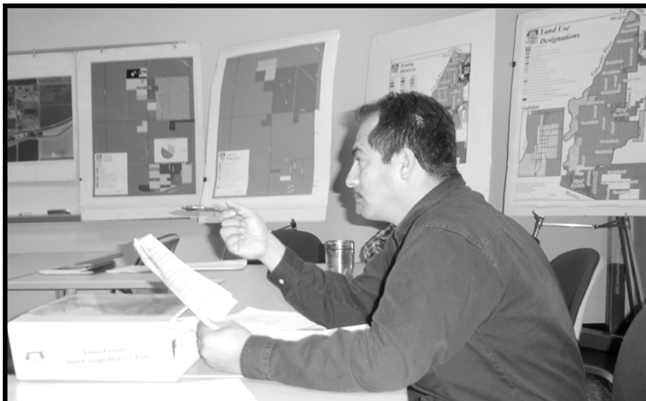
Figure 6: Staff working with CAG members.