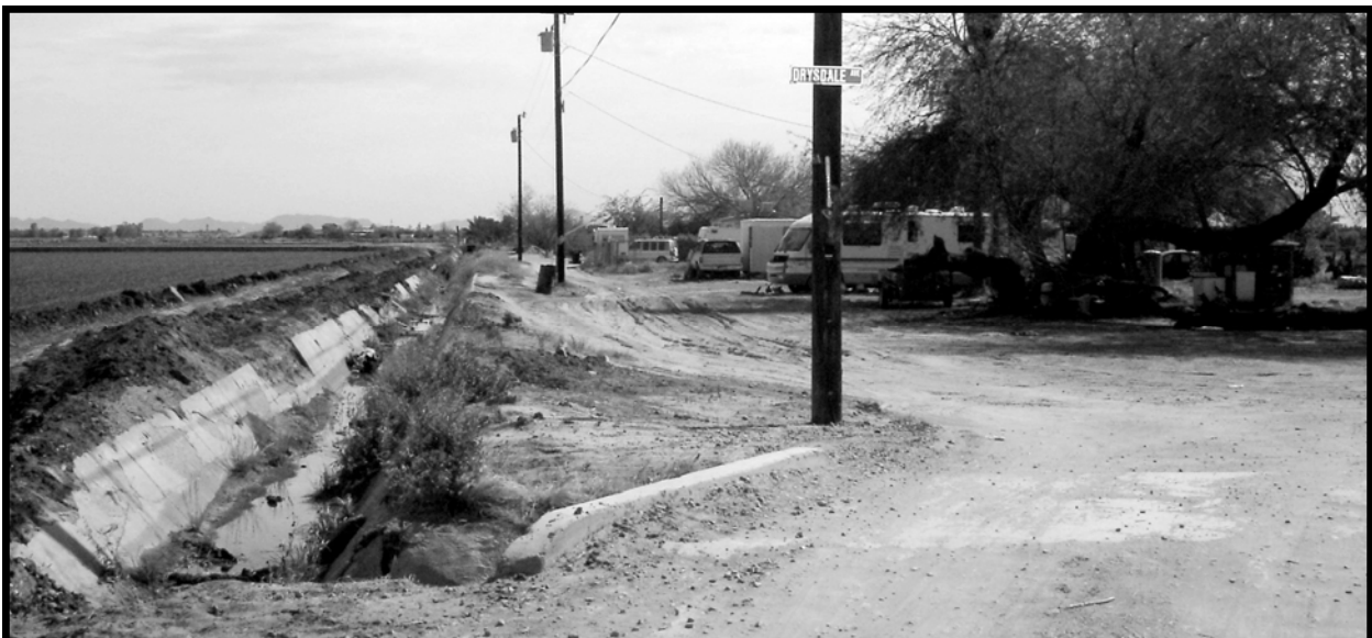
Figure 8: A Primitive Road in the Drysdale Area