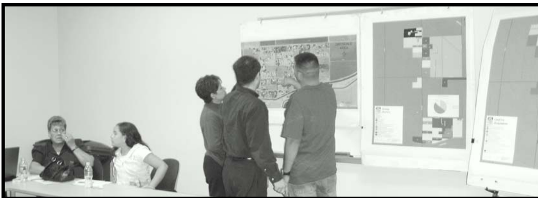
Figure 2: CAG Members

The CAG felt that the retention of agricultural lands should be kept as a priority and recommended adding new goals, objectives, and policies that support the retention of agricultural activities within prime agricultural lands found in the Yuma Valley Planning Area. Additionally, the CAG came to a consensus of the need to improve and maintain streets within the Drysdale area, County 14 th Street, County 15 th Street, County 12 3/4 Street and County 12 1/2 Street, should be kept a top priority. Other needs and issues that the CAG wanted to see identified in the Plan include: The construction of a community center in the township of Gadsden; promoting more open spaces and recreational uses along the Colorado River; the development and/or expansion of the local area transit system (YCAT) to accommodate the transportation needs of the residents of the planning area; the identification and support of grants necessary for infrastructure improvements in concentrated population pockets, like the Drysdale area and the Wall Lane area; and to support improvements and expansion to emergency services where a large number of population pockets exist in the Yuma Valley Planning Area.