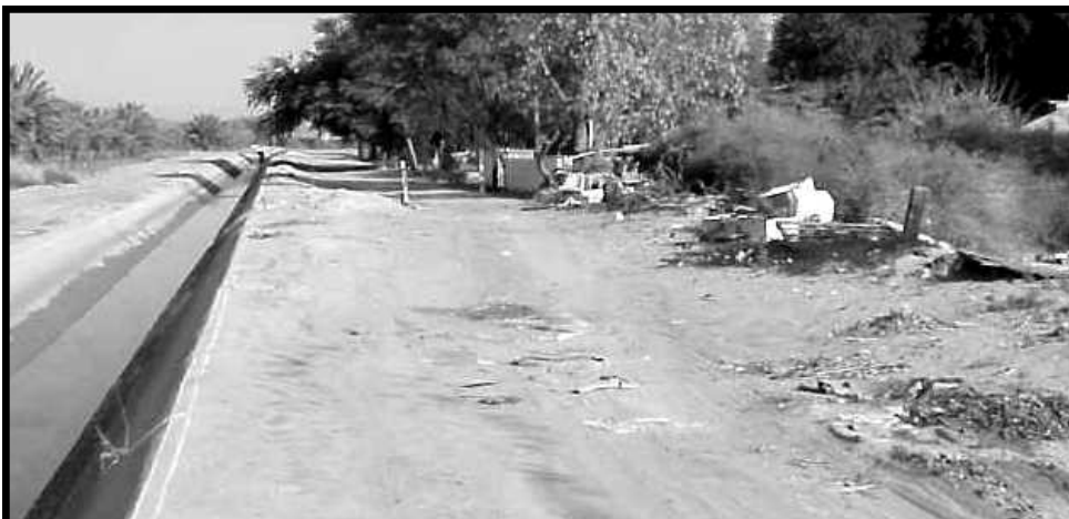
Figure 10: Illegal Dumping in the Yuma Valley Planning Area