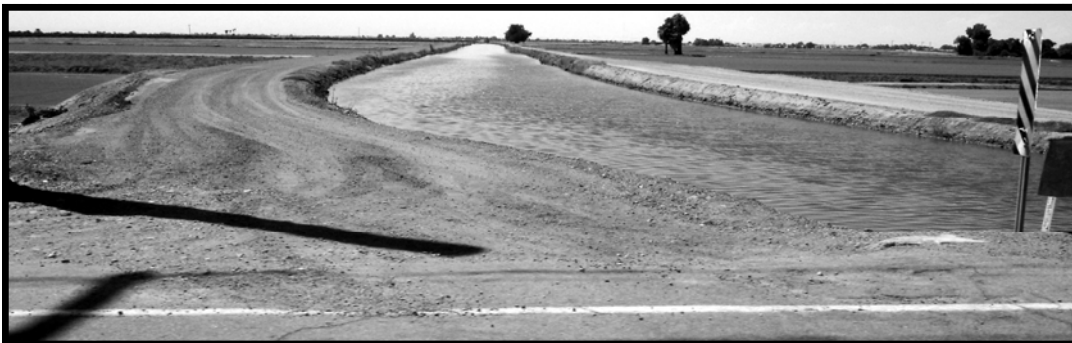
Figure 9: A Canal Road