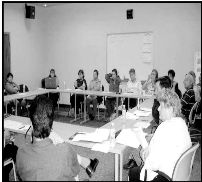
Figure 4: CAG Members

Twenty-three members of the CAG and the TAC attended this meeting. A copy of the meeting agenda and meeting notes can be found in Appendix B starting on page 36.