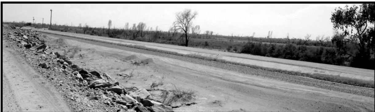
Figure 7: Hunter's Hole.