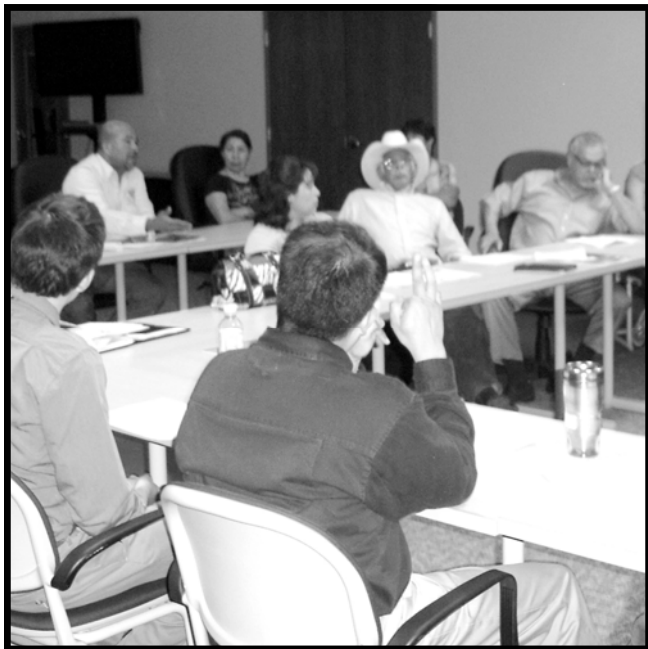
Figure 5: CAG Members

Chapter 4D includes Map 4B Comprehensive Plan Land Use Designations which depicts the land use designations for the planning area. The Land Use Element is critical to providing guidance for future growth and development in the County. Specific intentions and functions of the Land Use Element include: Representing countywide interests in where land uses should be located as well as the evolution of land use patterns; setting forth the general categories, distribution, location and extent of land uses; and providing maps to illustrate the location and distribution of land use categories.