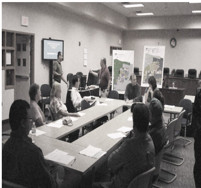
Figure 3: CAG Members

Twelve members of the CAG attended this meeting. A copy of the meeting agenda and meeting notes can be found in Appendix B .