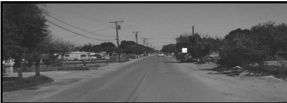
Figure 6: 5th Street and Avenue C