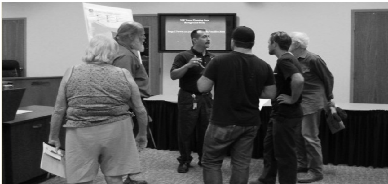
Figure 2: CAG Members discussing topics with staff

In general, the CAG felt that the planning area is a highly dense population area that lacks necessary infrastructure improvements as well as fire services, law enforcement services, trash abatement, to name a few. and recommended adding new goals, objectives, and policies that encourage adding new improvements and support needed services. Some of the infrastructure improvements and the services that the CAG members wanted to see identified in the Plan include: sidewalks on 5th Street; construction of parks or maintenance of green areas; improving street conditions; neighborhood clean up campaigns; graffiti abatement; street lights; widening of local roads; school bus stops on 16th Street area; extension of sewer lines on Pagent Avenue, North of 10th Place; storm drain sewer; more police patrolling the area; more signage for speed limits, among others.