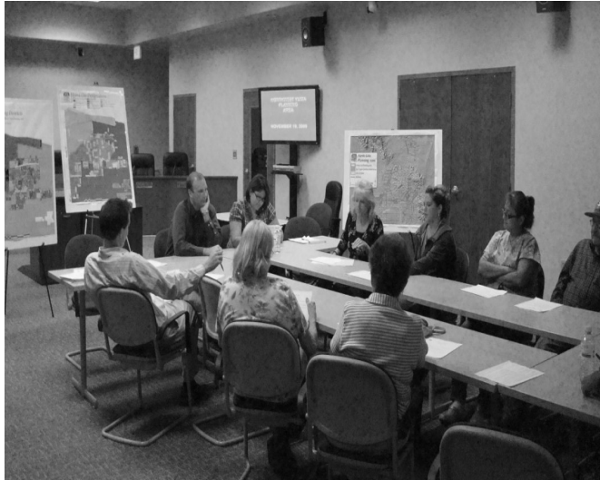
Figure 4: CAG Members

The Land Use Element is critical to providing guidance for future growth and development in the County. Specific intentions and functions of the Land Use Element include: representing countywide interests in where land uses should be located as well as the evolution of land use patterns; setting forth the general categories, distribution, location and extent of land uses; and providing maps to illustrate the location and distribution of land use categories.