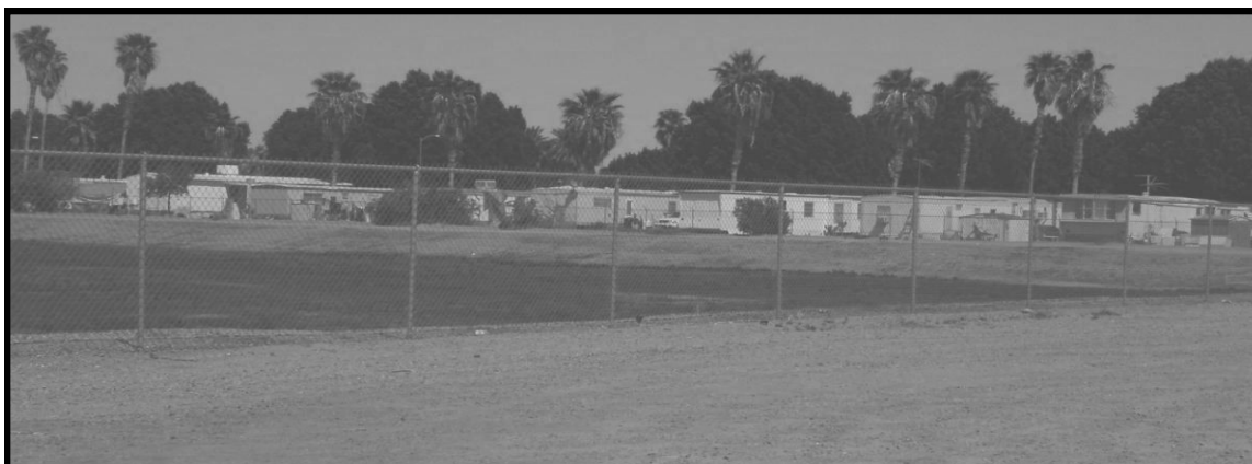
Figure 5: Riebe Avenue Retention Basin