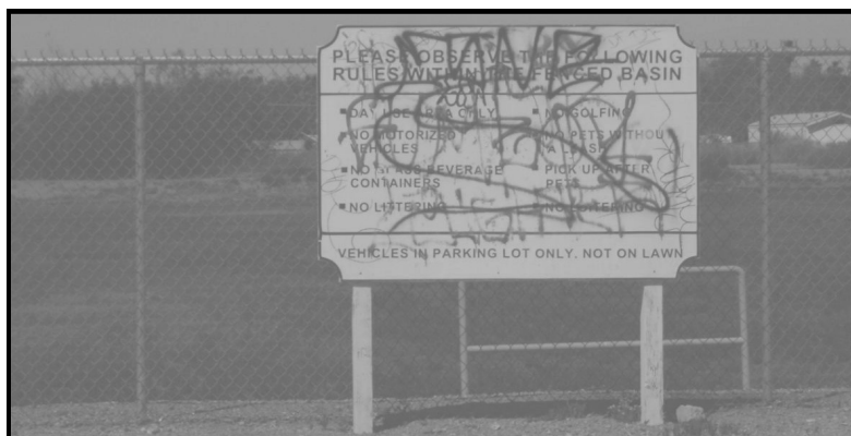
Figure 7: Graffiti is a problem in the Planning area