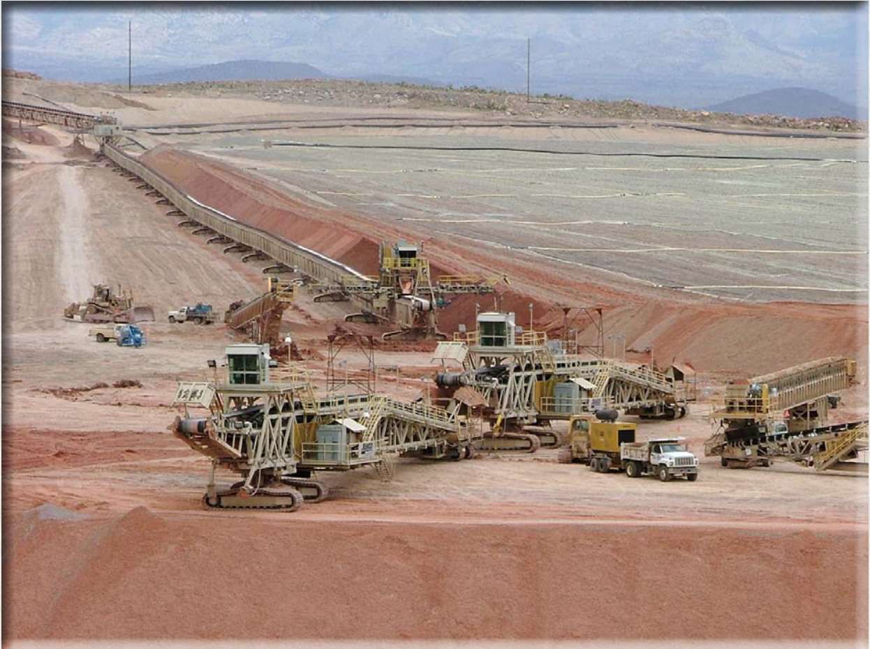
Stack loading at heap leach operation, Morenci, Arizona