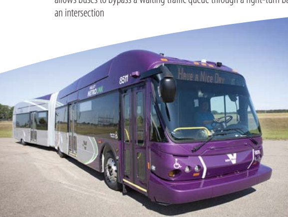
New Valley Metro LINK