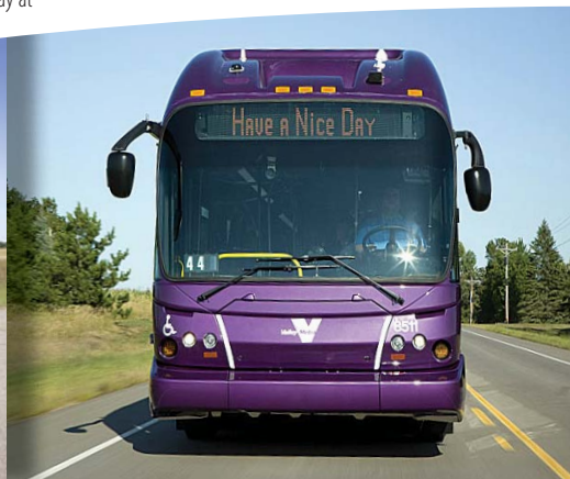
Seating capacity: 55