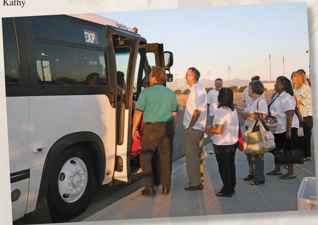
Passengers line up at the Surprise park-and-ride to board Route 571, an express bus route that has been popular among residents since service began in 2006.

For information about the Route 571 and Route 660 schedules, go to ValleyMetro.org .