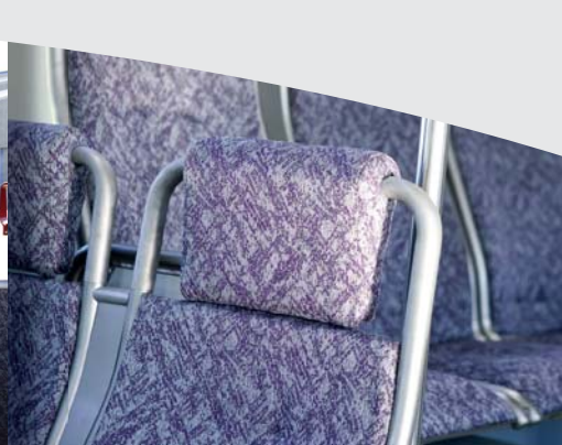
Padded seats with headrests