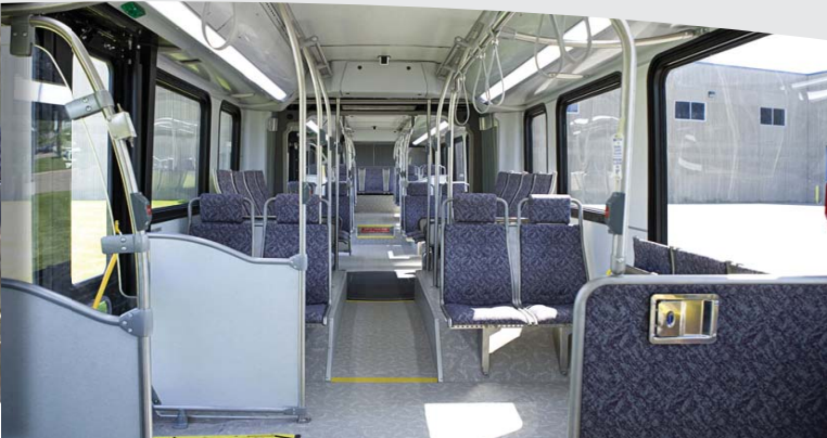
Great visibility and cool air conditioning