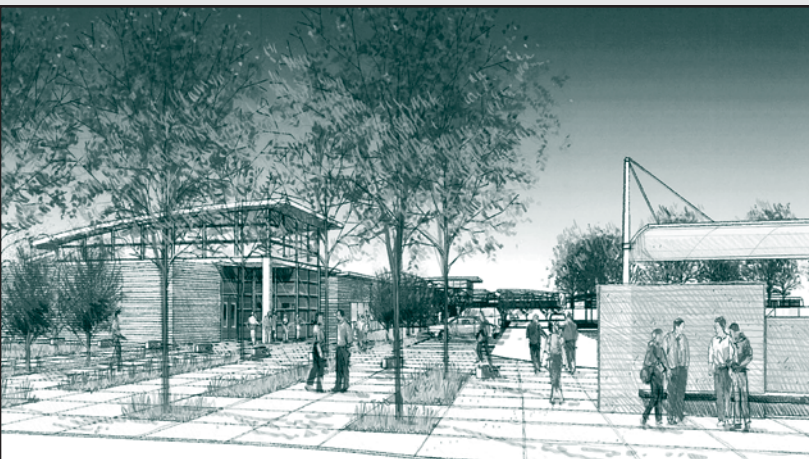
The 250-bus maintenance facility will be completed by spring 2007.

The public is welcome to attend the event held at 2050 W. Rio Salado Parkway. For a map of the area, go to www.tempe.gov/greenbuildings .