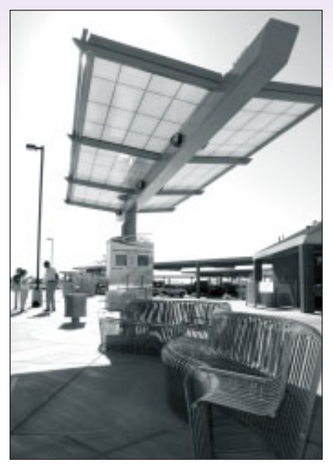
The new vehicle management system will soon send real-time bus arrival messages to electronic signs at RAPID stations.

Valley Metro buses have been equipped with satellite technology and modern communications equipment. Together, they constitute the