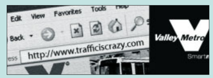
A new print ad promoting the Online Trip Planner will be featured in local publications.

The number of new, regular, and visiting bus riders who have taken the time to provide feedback on the new service speaks to its success. "I am very impressed!" wrote a first time Valley Metro rider. "It gave me two different options that will both work very well." To see how the Online Trip Planner works, go to www.ValleyMetro.org and click on the "Custom Bus Trip Planner" link.