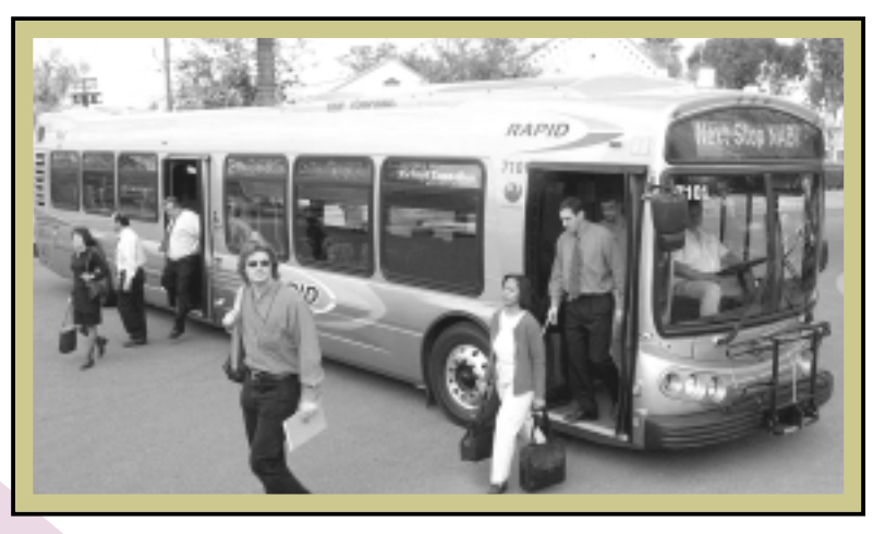
▲ RAPID will offer commuters to downtown Phoenix a fast, convenient, and comfortable alternative to driving in rush hour traffic.

The new service will be introduced on two routes on July 14. One route will travel along the I-10 Pagago Freeway and will originate at the park-and-ride at Pecos Road and 40th Street. The other will travel along State Route 51 and will serve the parkand-ride at State Route 51 and Bell Road, the Dreamy Draw Park-and-Ride (State Route 51 and Shea Boulevard), and the Paradise Valley Transit Center (Tatum Boulevard and Cactus Road). This fall, RAPID service