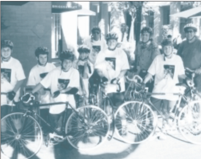
Bicyclists of all ages, including these Boy Scouts, participated in last year's Bike to Work and School Day.

All participants received free breakfast snacks, offered at four local businesses that sponsored the event. The first 200 riders also received free T-shirts.