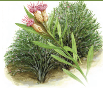
Arrowweed, a common shrub which disappeared when the Santa Cruz River dried up.

The Pima County Regional Flood Control District works with landowners to protect the floodprone areas from future development through conservation easements and acquisitions. Using bonds approved by voters in 1997 and 2004, lands along Sabino Creek, Honey Bee Wash, Bear Canyon, Tangue Verde Wash, San Pedro River, and Agua Caliente Wash will be preserved. Pima County will encourage the State Land Department to set aside state trust land along significant corridors such as Cienega Creek, Davidson Canyon, and others.