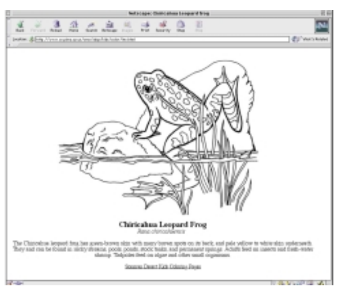
We have Coloring Pages to print and color of all the Threatened and Endangered species in Pima County. The Priority Vulnerable Species will be added soon. What a great way for children to learn about native species.

Kids Club that will meet at local recreation centers and other locations. The whole community will benefit from the creative excitement of Pima County's young citizens through exhibits of drawings, stories, posters, and photographs displayed at museums, galleries, websites, and a variety of places people gather.