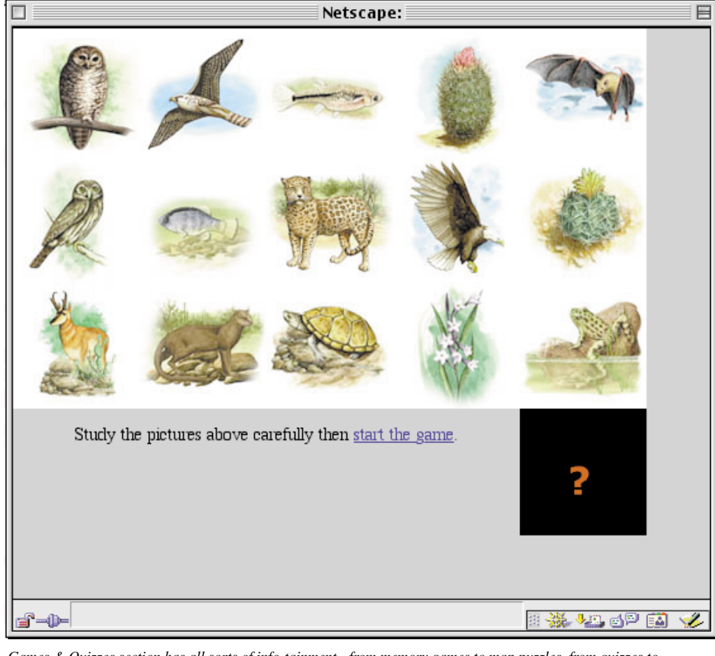
Games & Quizzes section has all sorts of info-tainment - from memory games to map puzzles, from quizzes to sliding tiles games

For more information about how to join the Sonoran Desert Conservation Plan for Kids, call (520) 740-8800 or (520) 740-2690 or visit our website now!