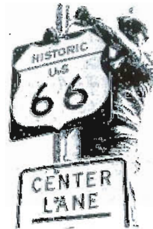
Corridor signage promotion image appears in ADOT website