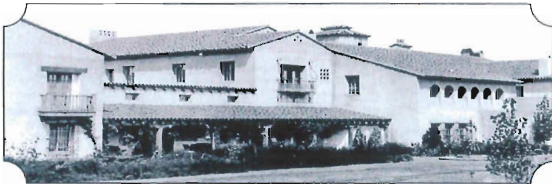
La Posada in Winslow, Arizona

Private ownership and commercial development are found along this B-40 segment of Route 66. The Navajo Nation and Hope Reservation are located north of Winslow. The Apache Sitgreaves National Forest is located south of Winslow.