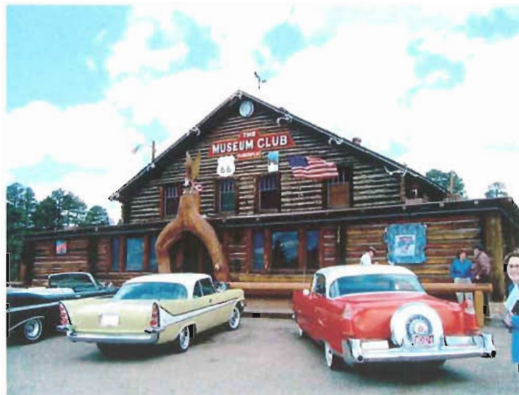
Museum Club along Route 66 in Flagstaff, Arizona