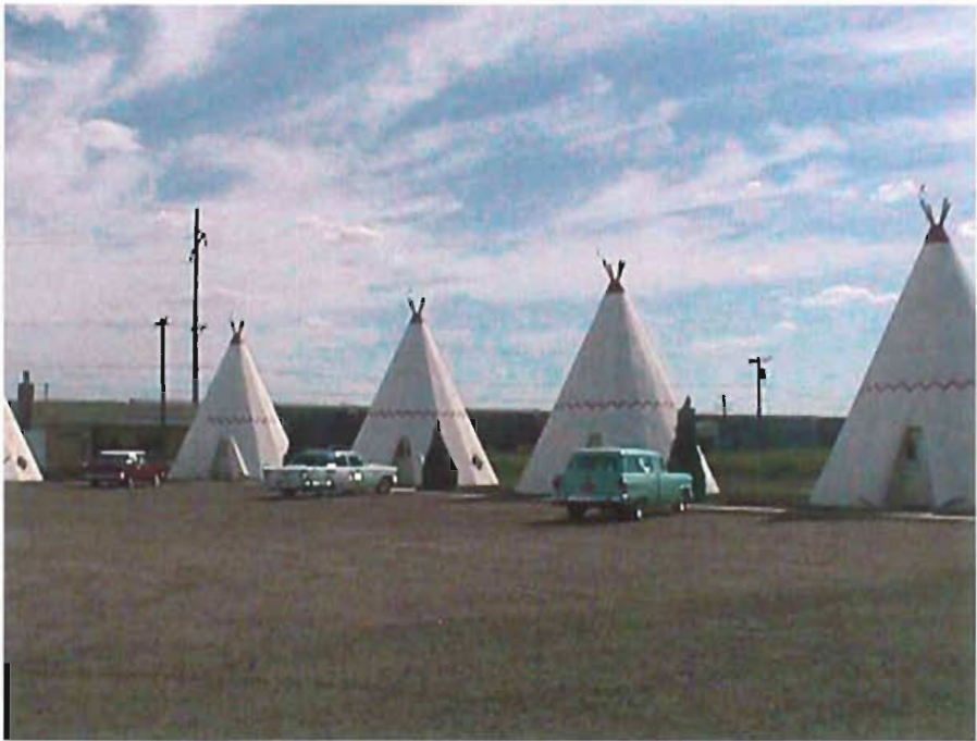
Wigwam Motel along Route 66 in Holbrook, Arizona