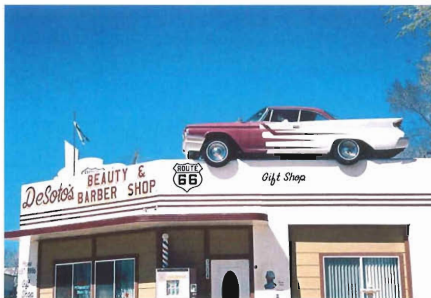
Shopping along Route 66 in Ash Fork, Arizona

Ash Fork began as a stage depot, and grew with the coming of the railroad. Mining was important to its economy. Route 66 runs the length of the town and some motels, gas stations and businesses have operated since the highway's beginning in 1926.