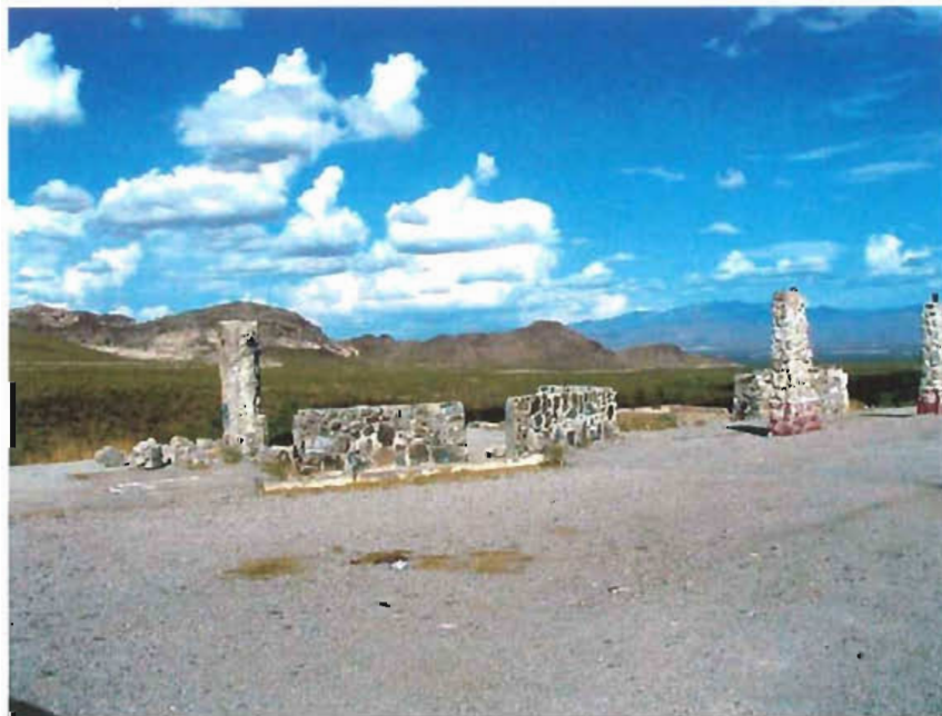
BLM, Back Country Byway (Road from Kingman to Oatman)

Most of the land along Old Oatman Road from McConnico to Goldenrod is privately owned or managed by the Bureau of Land Management. Very little of it has been developed. There are a few new commercial structures on the north side of Old Oatman Road immediately west of the McConnico exit off I-40. There is one old auto service establishment across the road from the new commercial structures. Few if any of the lots in a couple of small residential subdivisions located west, toward the to the wash bed, have been put to use.