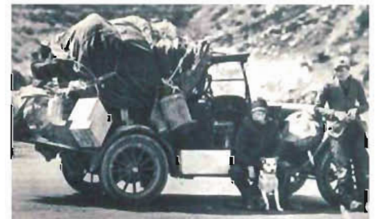
Pilgrims above Topock Crossing