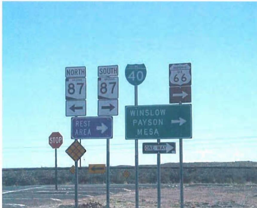
Route 66 Signage in Arizona