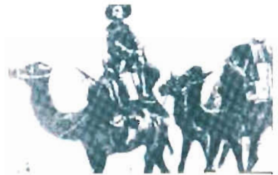
Army explorers used camels to layout the original route across Northern Arizona