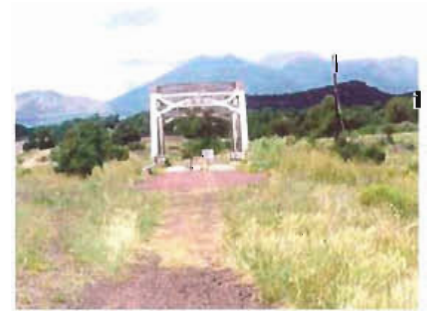
Abandoned steel bridge near Winona, SE of Flagstaff

(a) broken or revised alignments. Compilation of a detailed inventory of these problems would be an important first chore for concerned citizens, roadway officials, destination reps, tour promoters and marketers. In fact, the dispositive view of which problems should first be addressed, and how, should come from local decision-making processes. However a couple of examples would help to illustrate the difficulties. Reference has elsewhere been made to the realignment of the original Route 66 to bypass Oatman. The Oatman community almost disappeared when that happened. In Winslow and Ashfork, traffic managers split the old Route 66 alignment into two one-way streets passing in opposite directions through their central business districts. Though practical from the standpoint of traffic management, this revision in the alignment creates confusion for the motorist. A westbound traveler looking for La Posada, for instance, could drive all the way through Winslow before realizing s/he had missed the place. It fronts on the eastbound one-way. Similarly, the old Route 66 roadway has been broken up on the southwest side of Kingman. Although it seems there would be some benefit in directing interested travelers off the Interstate into Kingman along the old alignment, the connections are poorly marked and difficult to navigate from the IH-40 Exit at McConnico.