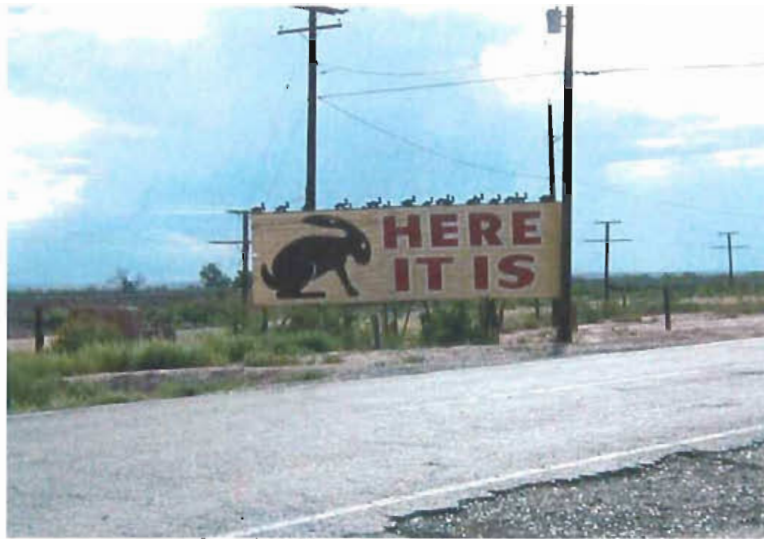
Route 66 in Joseph City, Arizona