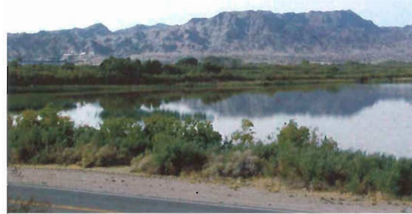
Havasu Wildlife Refuge, Colorado River, Arizona

Primary recreational opportunities near I-40 Exit 1 would be limited to such activities as USFWS might permit on the refuge, and to water sports supported by facilities at Lake Havasu itself. Most of the land from Golden Shores to Baker Spring area is subject to BLM management.