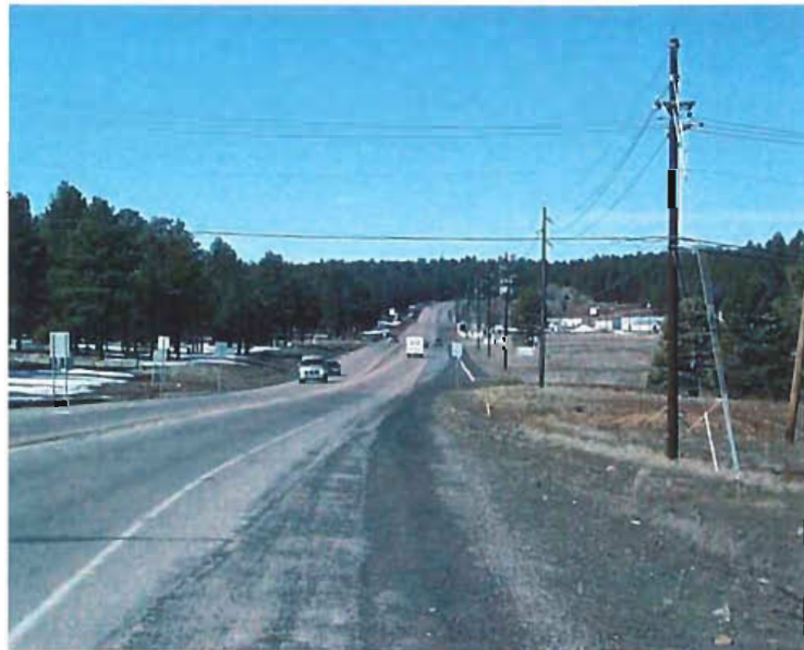
Flagstaff two 12-foot lanes with turn lanes