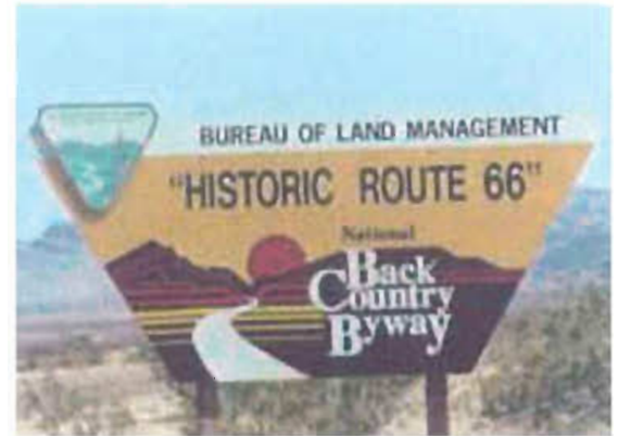
BLM corridor destination identification sign

A related set of questions and issues arise from the fact that several agencies, ADOT (Arizona Parkways, Historic and Scenic Roads) and Bureau of Land Management (BLM) have already introduced special corridor or segment-level directional and interpretive signs to draw attention to touring experiences accessible via significant reaches of the old roadway. It appears that at least three communities along the route, notably Williams, Seligman and Winslow previously introduced their own flavor of Route 66-oriented signage. Opportunities for coordinated signing as part of a coherent wayfinding system are apparent. But an effort must be made to bring the various government and public interest agencies and destination-specific stakeholders together for collaboration and joint sponsorship that benefits their common objectives in effective promotion, wayfinding and interpretation.