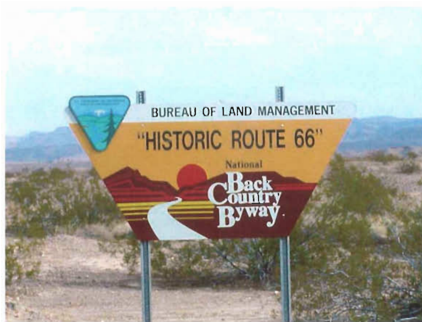
BLM Back County Byway

Some books used to advise travelers that the portion of Route 66 between Oatman and Topock/Golden Shores was not recommended for travel; this is no longer the case . Through the efforts of the people of these communities, this portion of Route 66 has been completely resurfaced, maintained and provides a scenic and delightful drive. The Bureau of Land Management has dedicated this section of highway from Topock/Golden Shores through Oatman to McConnico (west of Kingman,) as a Historic National Back Country Byway." This truly signifies the importance and scenic value of this fascinating stretch of the original Route 66.