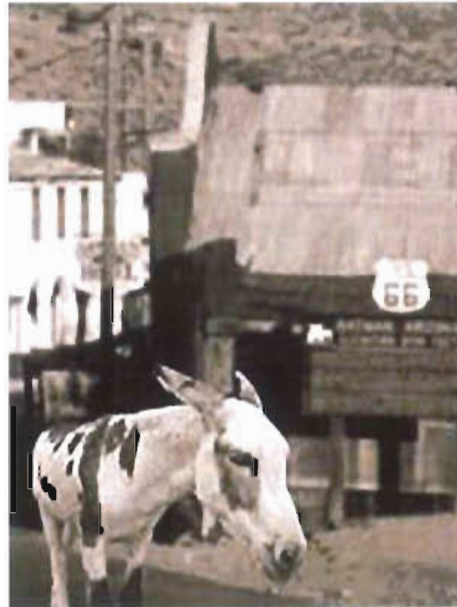
Downtown Oatman, Arizona

At an elevation of 2,400 feet in the Black Mountains, Oatman was once the last stop in Arizona before entering the dreaded Mohave Desert in California. Oatman was founded in 1906 as a commercial center for nearby mining camps, and was at one time considered to be the richest gold mining district in the state of Arizona. The combination of mining and endless traffic on Route 66 made Oatman a boomtown. In 1953, Route 66 was rerouted through Yucca as the traffic had become too much for the steep, winding road. Today, the town's one street is lined with historic buildings and boardwalks. In the middle of town is the Historic Oatman Hotel, a unique double-walled adobe two-story building. On the weekend, locals dressed up as desperadoes stage gunfights for the camera-toting tourists. While in Oatman, be sure to meet some of the town's "wild burros." Descendants of the work animals of the mines, these burros have found paradise. They nuzzle along for handouts, wandering all over Main Street, posing for pictures and stopping traffic. These born hustlers are experts at playing the tourist game.