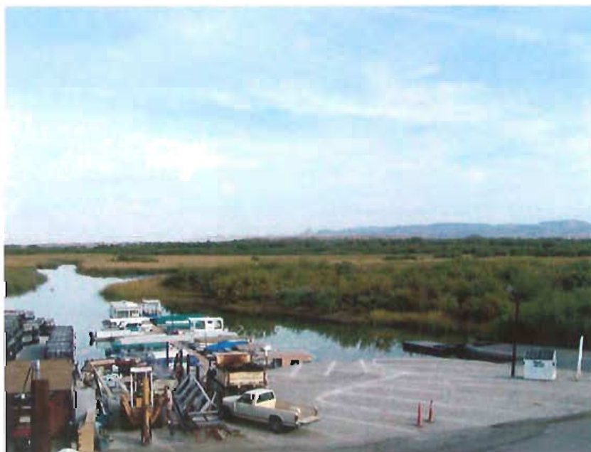
Lake Havasu, Arizona