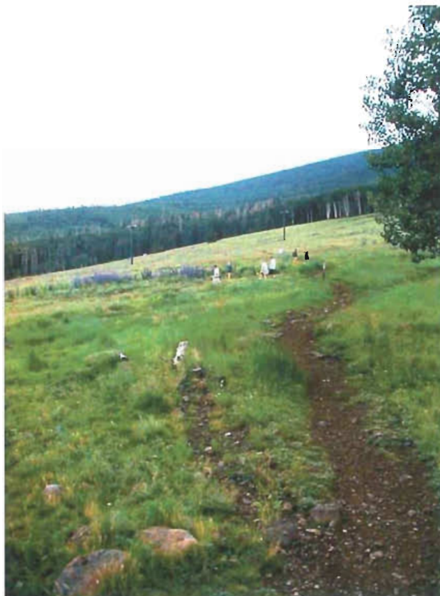
Hiking at Snowbowl (San Francisco Peaks) near Flagstaff, Arizona