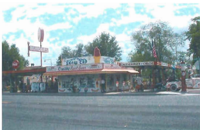
Snowcap Restaurant, Seligman, Arizona