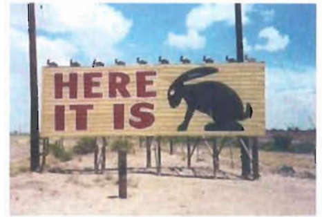
One of the Jackrabbit signs

Period Signage as Landmarks in Cultural Landscape. Part of the Route 66 “mystique” has to do with the character and variety of signs used by roadside service providers and merchants to attract the attention of travelers. The Burma Shave sign sequence in the right-of-way east of Kingman, the 50’s era Hollywood murals and cafe neon in Williams, and the big Jackrabbit Saloon signs near Holbrook all provide excellent examples. Other specie of period signage could be described as eclectic, whimsical, or “eccentric.” Roadside advertising strategies and methods, sign technology and signing regulations have changed during the last century. Much of the travel service business for which period signage was created no longer exists. There might be some question as to whether contemporary sign officials would approve of their size, placement, or technology. Therefore careful attention must be paid to questions having to do with preservation, restoration, and visibility of period signage, and to how such signage contributes to the wayfinding and the unique quality of the touring experience in the Arizona segment of Route 66.