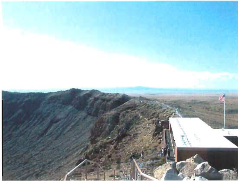
Meteor Crater, Arizona