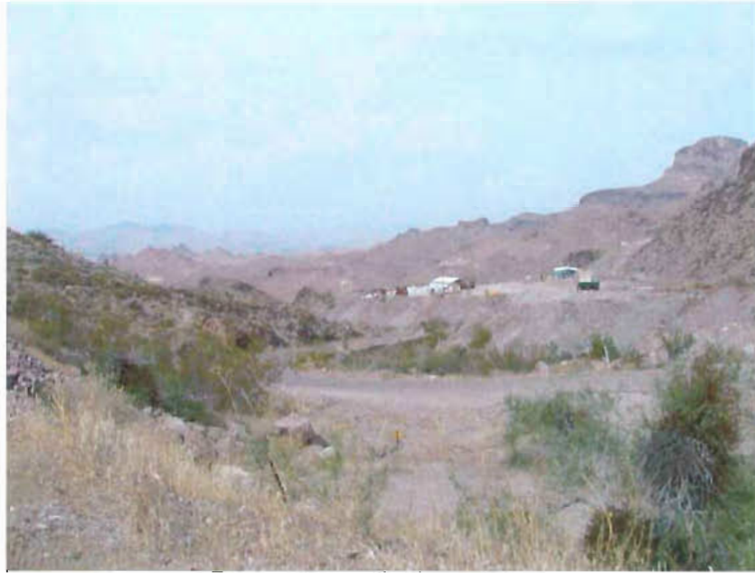
Route 66 near Oatman, Arizona