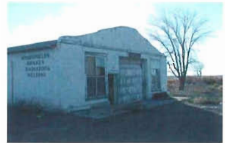
Abandoned garage at Joseph City

Corridor Identification - Announcing the Beginning and End of the Arizona Segment. Several challenges and issues are found at the general level of interest in the Arizona portion of old Route 66 as itself a destination. Private tour promoters have devoted considerable attention to Route 66 as a unique “heritage” touring experience. But it appears that most of the attention has been given over to larger extents of the old highway, or focused on its western reaches in Southern California. So the absence of physical identification and presentation of the Arizona portion of the corridor presents a problem to be addressed and overcome as part of effective corridor management.