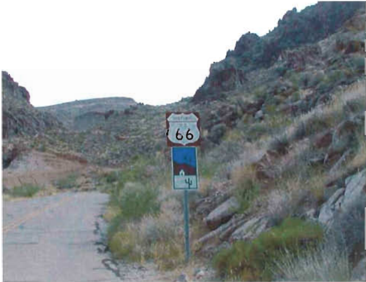
Oatman to Kingman. Two 12-foot lanes with varying width gravel shoulders.