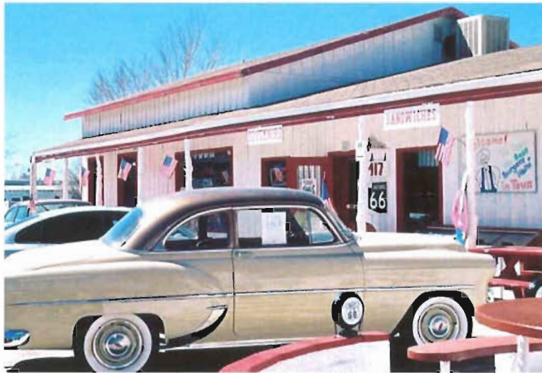
Shopping along Route 66 in Williams, Arizona

The last Route 66 Town to be bypassed by I-40, Williams is known as "The Gateway to the Grand Canyon." The one and one-half mile stretch of Route 66 through the heart of the small town was once thick with motels, restaurants and shops.