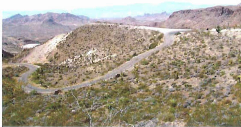
Route 66, Black Mountains, Arizona