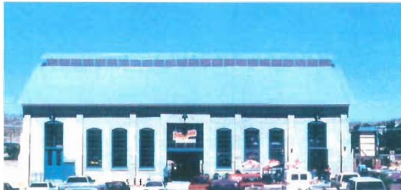
Powerhouse, Kingman, Arizona

Access to rail and wagon routes helped establish Kingman as a trade and transportation center. By 1882, Kingman was officially a town. Route 66 parallels the railroad track, and Kingman has always been a staunch Route 66 town with many motels, cafes, and service stations. Today, the I-40 Business Loop runs straight through Kingman, and is still a major stop for travelers. The old downtown area on Route 66 has not changed much over the years, and a brief tour of Andy Devine Avenue and Beale Street will give you a glimpse of the past.