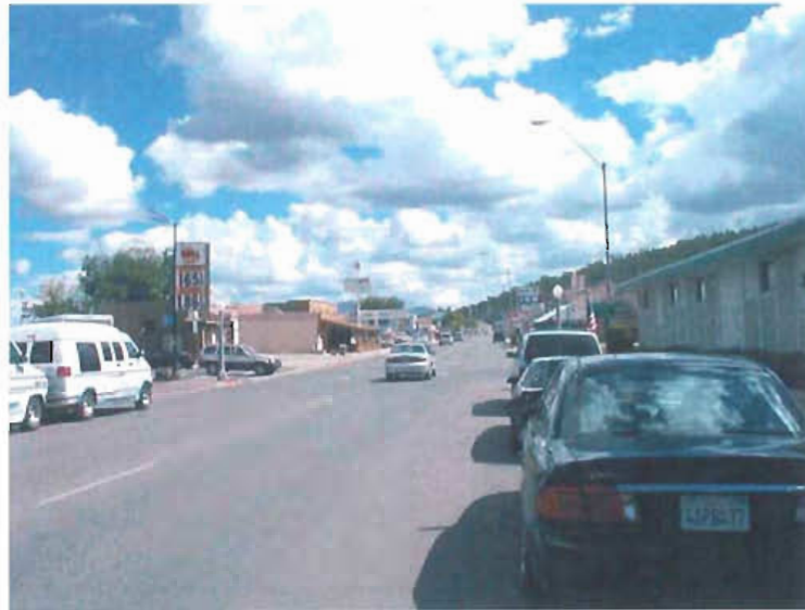
Williams section. Two 12-foot lanes with parking