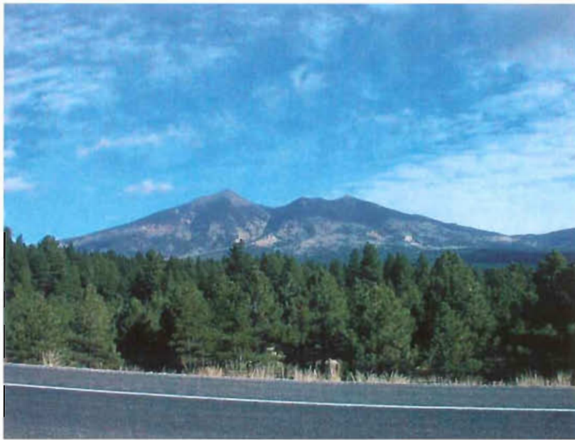
San Francisco Peaks, Flagstaff, Arizona

After driving through the ponderosa and pinyon/juniper forests of the high desert, the byway travels back into desert terrain and heads towards the magnificent Grand Canyon . Located north of the byway, the Grand Canyon has humbled men and women since Route 66 first began bringing them to its door.