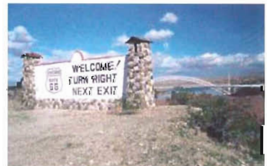
Landmark sign on California side of Topock Crossing at Colorado River

Neither the beginning nor the end of the Arizona portion of corridor is clearly announced from Interstate Highway 40 at Holbrook or Topock. Ironically the most prominent existing corridor-specific landmark-sign is located across the Topock Crossing on the California side of the Colorado River. It might be reasonable to wonder if the east end of the Arizona