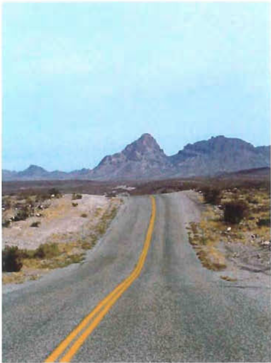
Topock to Oatman section. Two 12-foot lanes with varying width gravel shoulders.