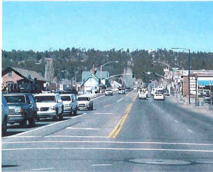
Flagstaff four 12-foot lanes with turn lanes

The following images show the varying roadway conditions found along Route 66 in Arizona.