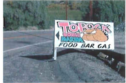
Lake Havasu recreation services at Topock