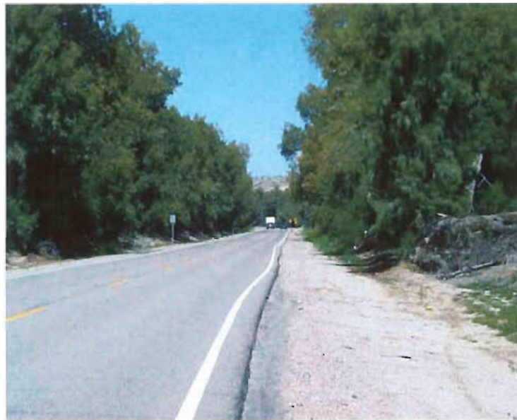
Topock to Oatman section. Two 12-foot lanes with varying width gravel shoulders.