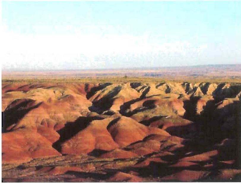
Painted Desert, Arizona