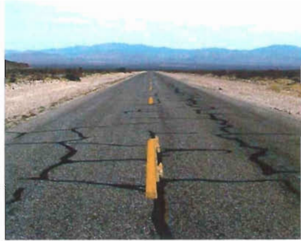
BLM Backcountry portion of Route 66