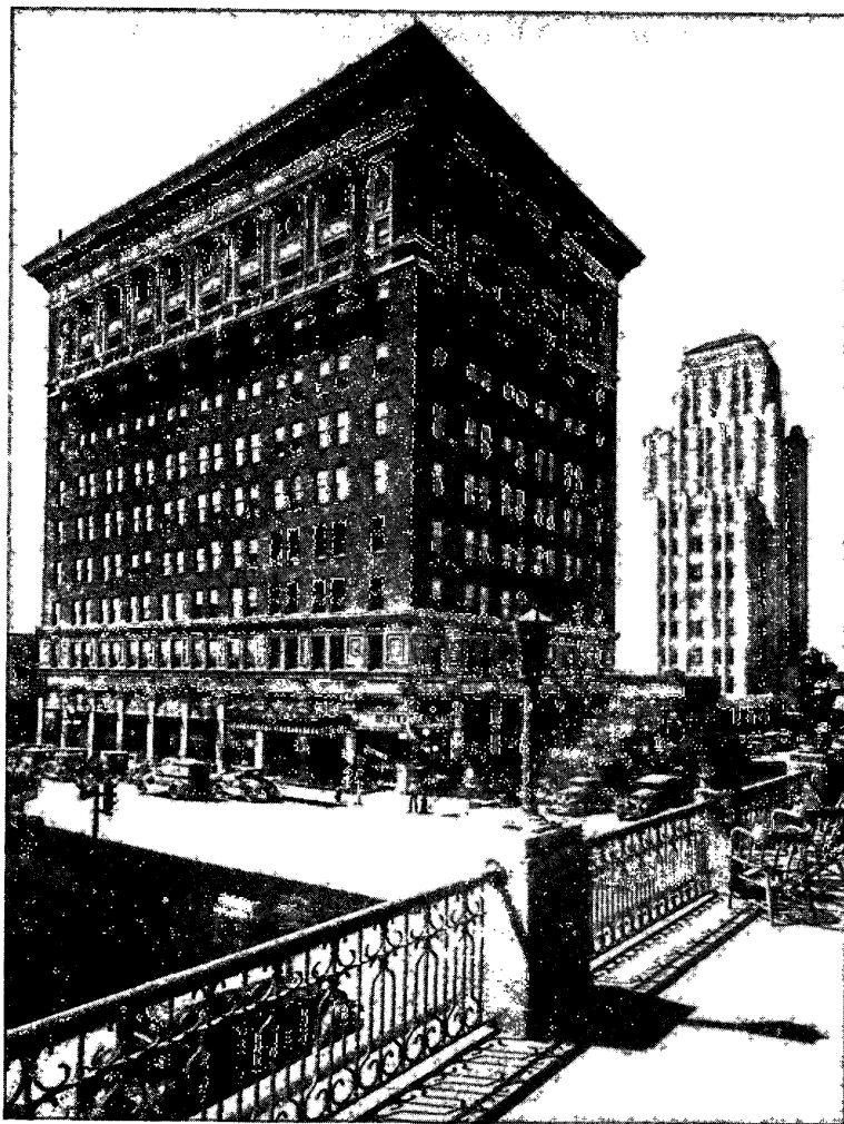
Luhrs Office Building and Luhrs Tower. Phoenix, Arizona, ca. 1910.