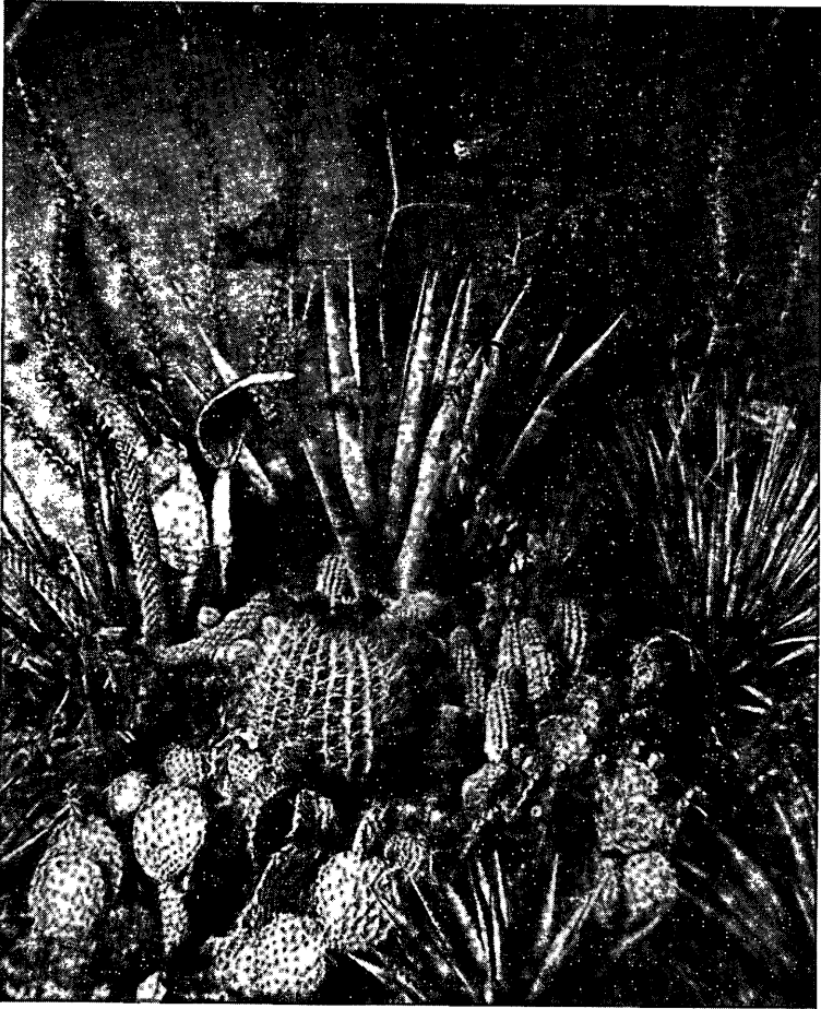
Still life of cactus. Photograph by [Henry] Buehman & Co., Tucson, Arizona. Arizona Views 11 [CP SPC 182:10]

The Department of Archives and Manuscripts is fortunate to possess one of the finest collections of photography in the Southwest. The Department collects primary and secondary materials in four areas, and each area has its own collection of photographs.