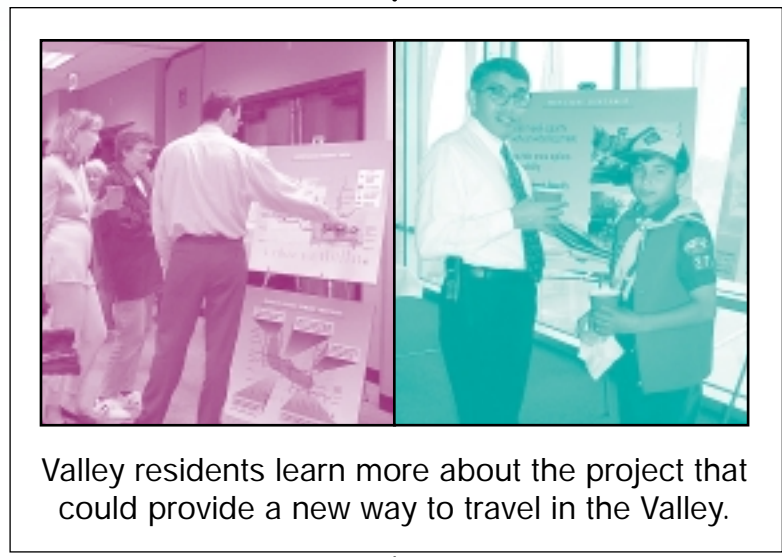
Valley residents learn more about the project that could provide a new way to travel in the Valley.

Overall Planning Process: Some suggested using and sharing more information from existing light rail systems in Portland, San Diego, and Dallas.