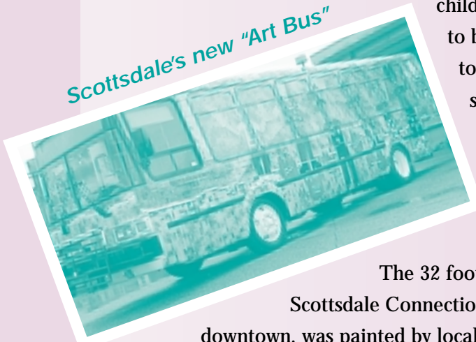
Scottsdale's new "Art Bus"